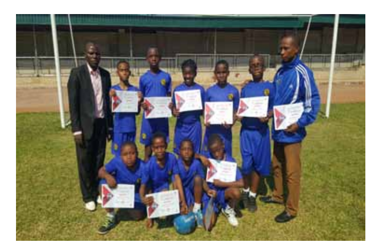
Some of the football players from Ifesie House

Red House - 1st Ifesie House - 2nd Green House - 3rd Yellow House - 4th