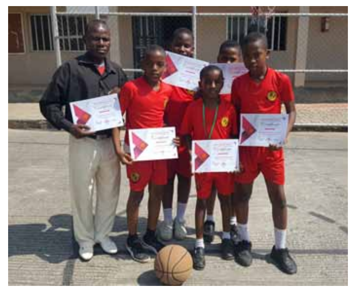
Some of the basketball players from Red House