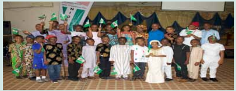
Long live New Capital School Long live the Federal Republic of Nigeria